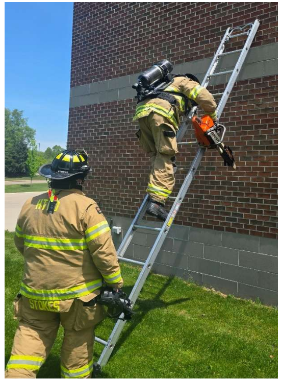
Ventilation Training Ladder Training