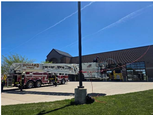
Aerial Operations Rope through Hula Hoop (Fitness Training)