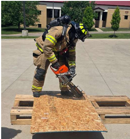
Ventilation Training Chain saw Operations