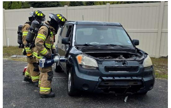
Vehicle Extrication Mock EV Work in Airpack's