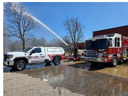
Foam trailer training