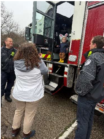
Easter Egg Hunt PR Event