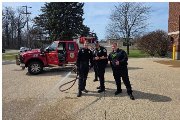
Brush Truck Training