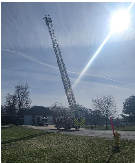
1241 Aerial Operations Training